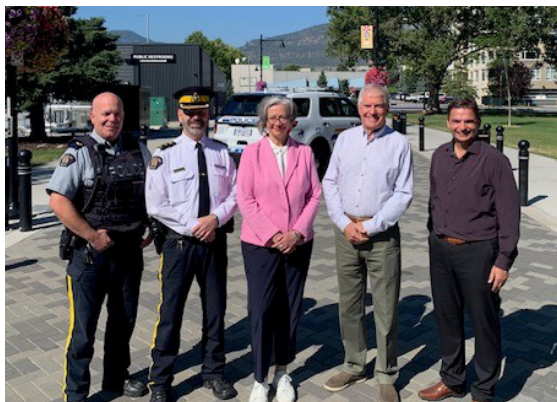
Minister of Health and Mental Addictions Jennifer Whiteside stands with Mayor Julius Bloomfield and agency partners after announcing the Car 40 program for Penticton.

"This service will allow people in mental health crisis to be treated with a greater level of care and concern and connect them with the assistance they need," says Mayor Bloomfield.