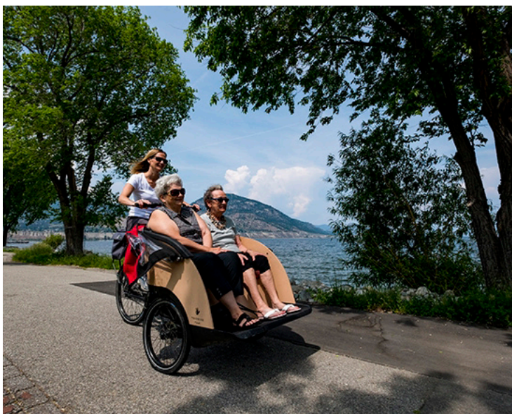
Penticton residents enjoy an outing with the Cycling Without Age program that began in the city in 2018.

Penticton is taking steps to become recognized by the Province as an age-friendly community. As part of the process, the City is encouraging everyone from kids to seniors to get inspired and take part.